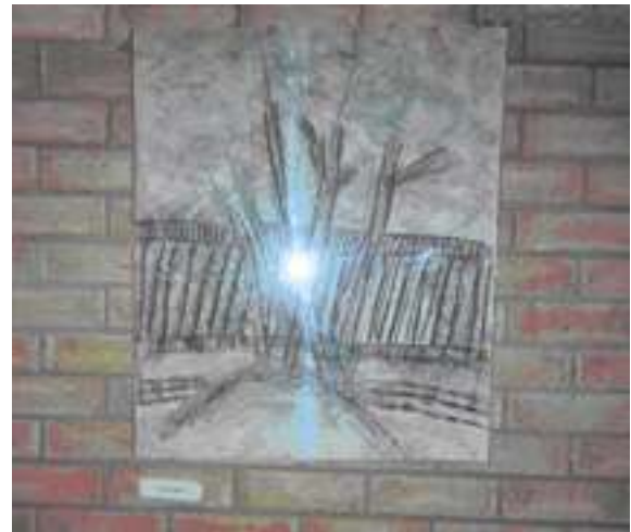
El Nou (Light)

Islamic art often depicts things of nature as below (my own piece) but often geometrical designs that are inspired from nature's beauty.