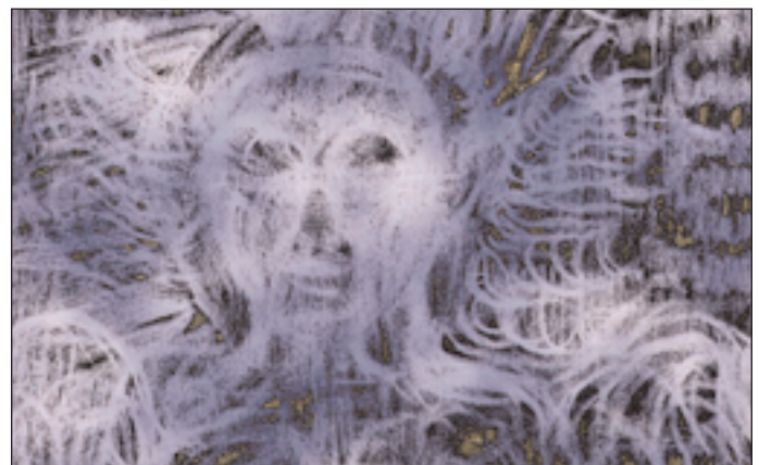
Detail from a charcoal drawing manipulated with added colour.