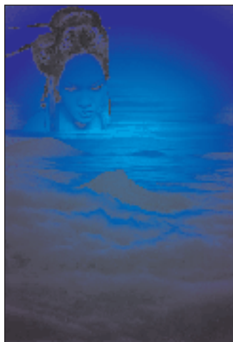
Digital montage in blue